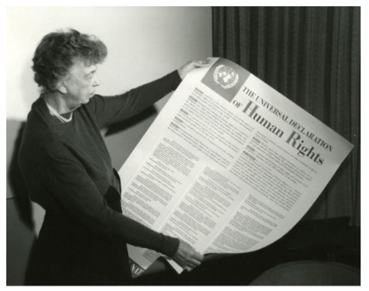
Eleanor Roosevelt holding the UDHR

Specifically, December 10<sup>th</sup>, is International Human Rights Day. On this day, in 1948, 192 member states of the United Nations signed the United Nations Declaration of Human Rights (UDHR). (<u>UN.org</u>)