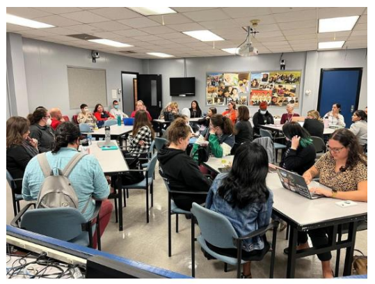
RPS Equity Advisory Board

For community members wishing to get involved in equity and human rights issues,